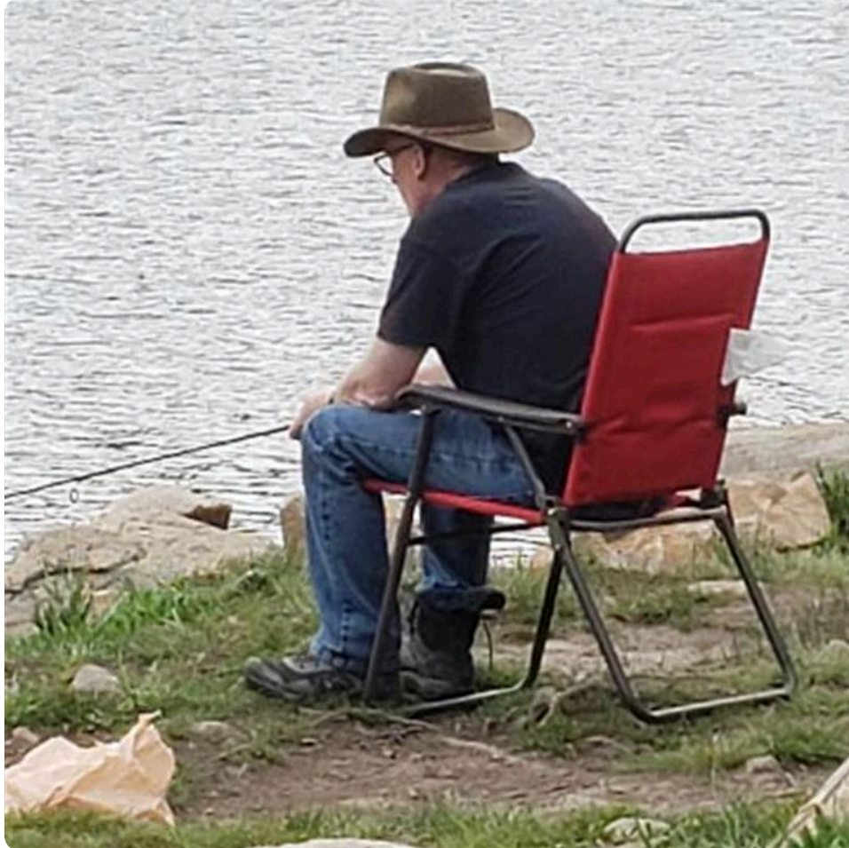
Favorite pass time.